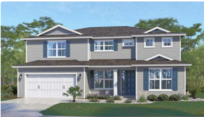
UPGRADED ELEVATION A