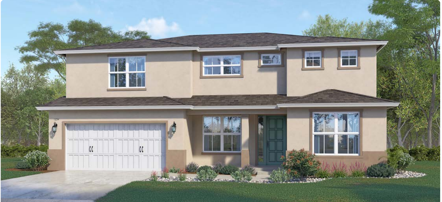
STANDARD XPRESS ELEVATION

4 Bedroom | 4.5 Bath | 3 Car Tandem Garage | Loft | Flex Room Dining Room | Great Room | Laundry Suite | Covered Entry | Covered Lanai 3,125 A/C Sq. Ft. | 4,113 Total Sq. Ft.