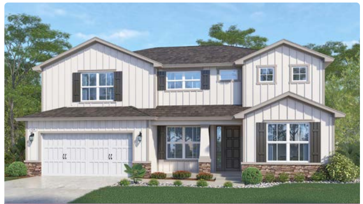
UPGRADED ELEVATION B