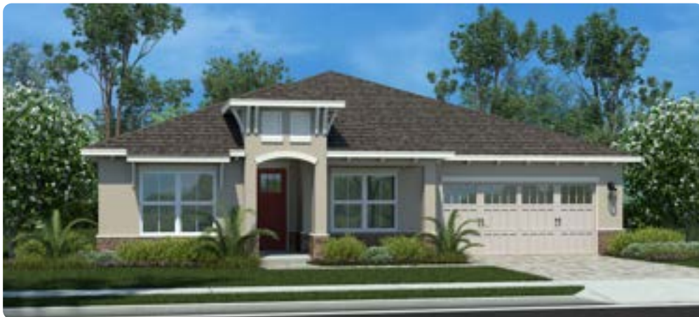
UPGRADED ELEVATION F