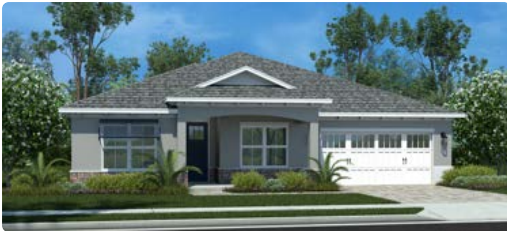
UPGRADED ELEVATION E