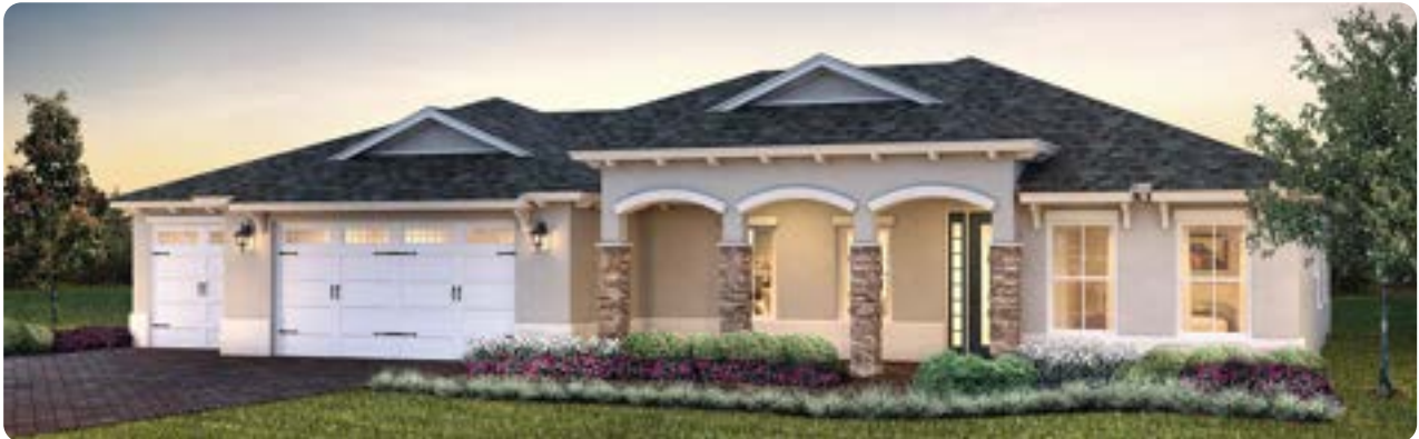
UPGRADED ELEVATION E