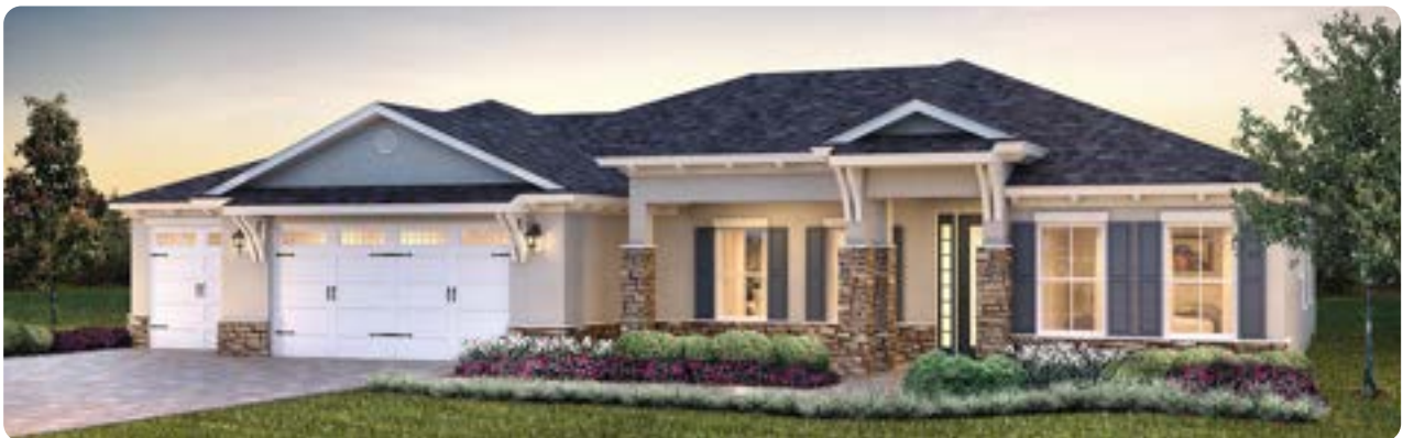
UPGRADED ELEVATION F