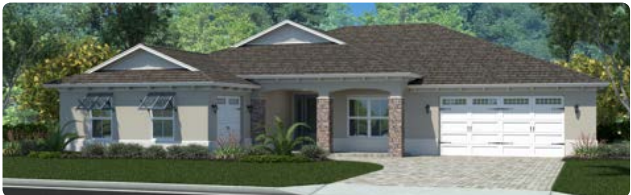
UPGRADED ELEVATION E