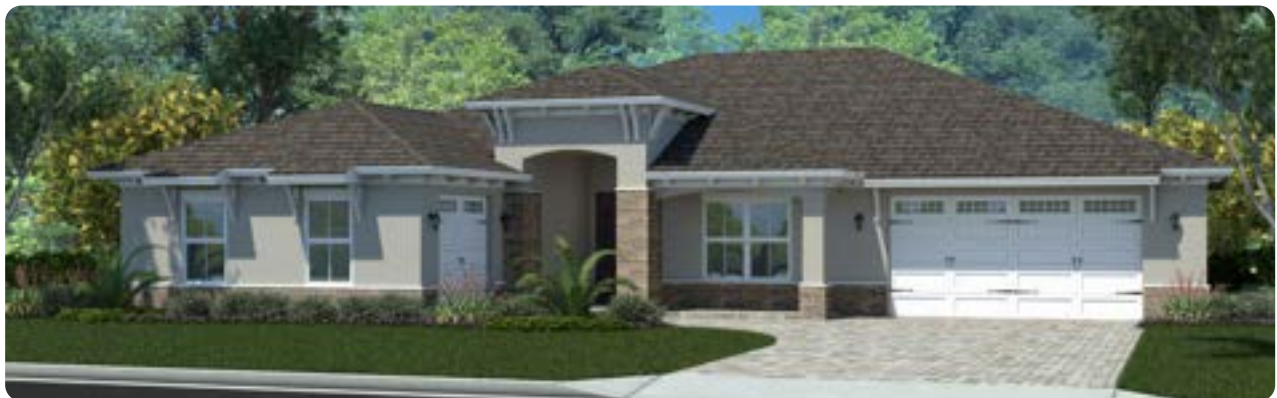
UPGRADED ELEVATION F