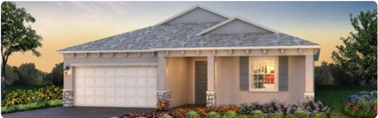
UPGRADED ELEVATION C