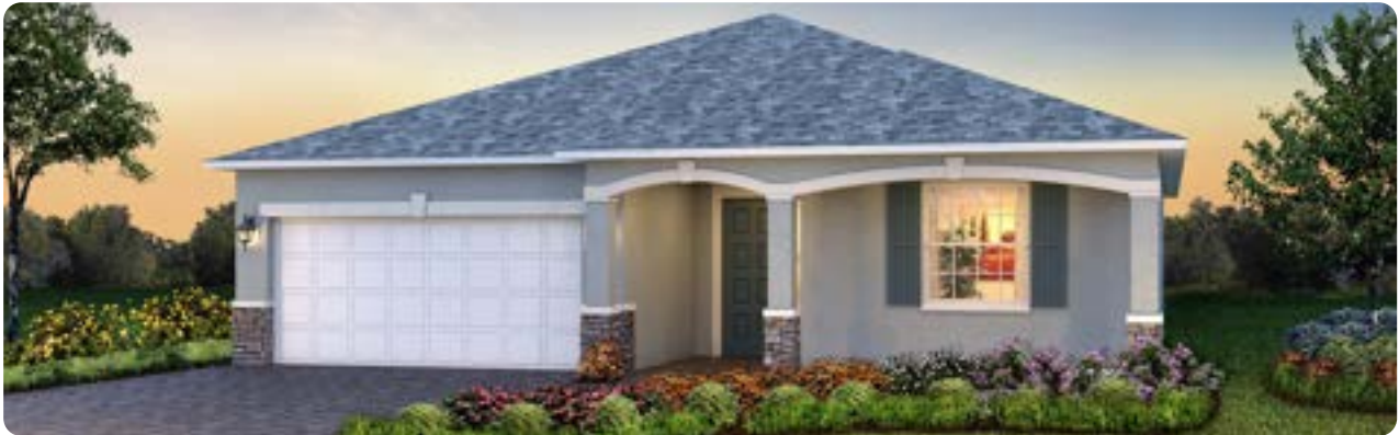
UPGRADED ELEVATION B