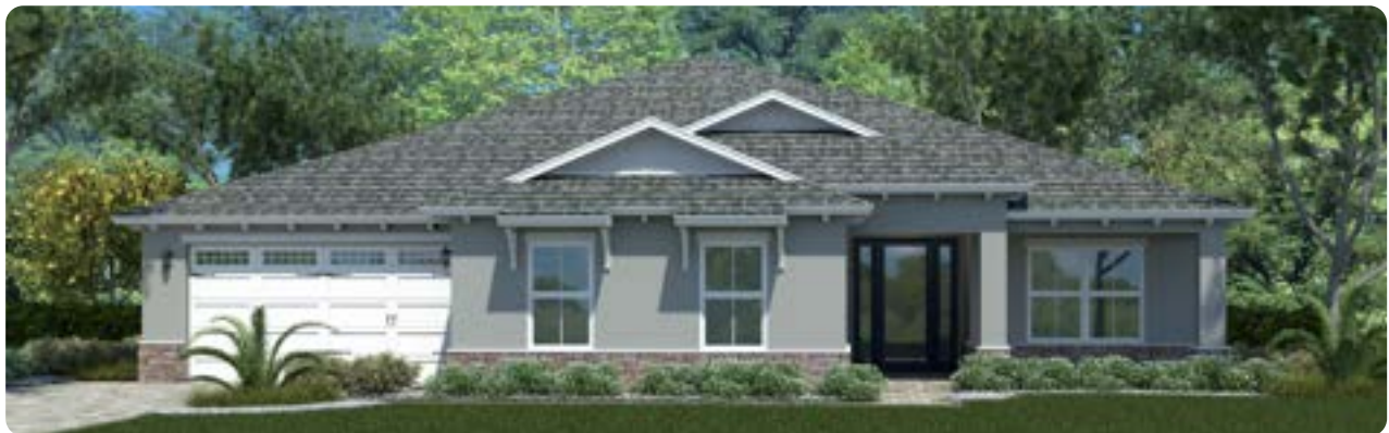
UPGRADED ELEVATION E