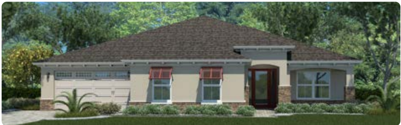
UPGRADED ELEVATION F