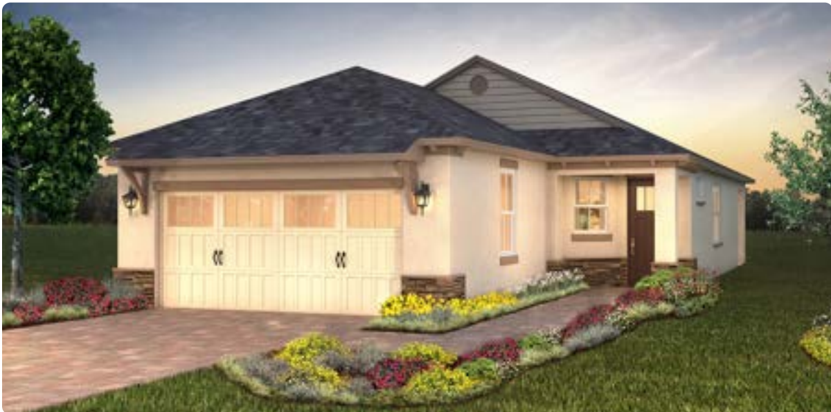
UPGRADED ELEVATION D