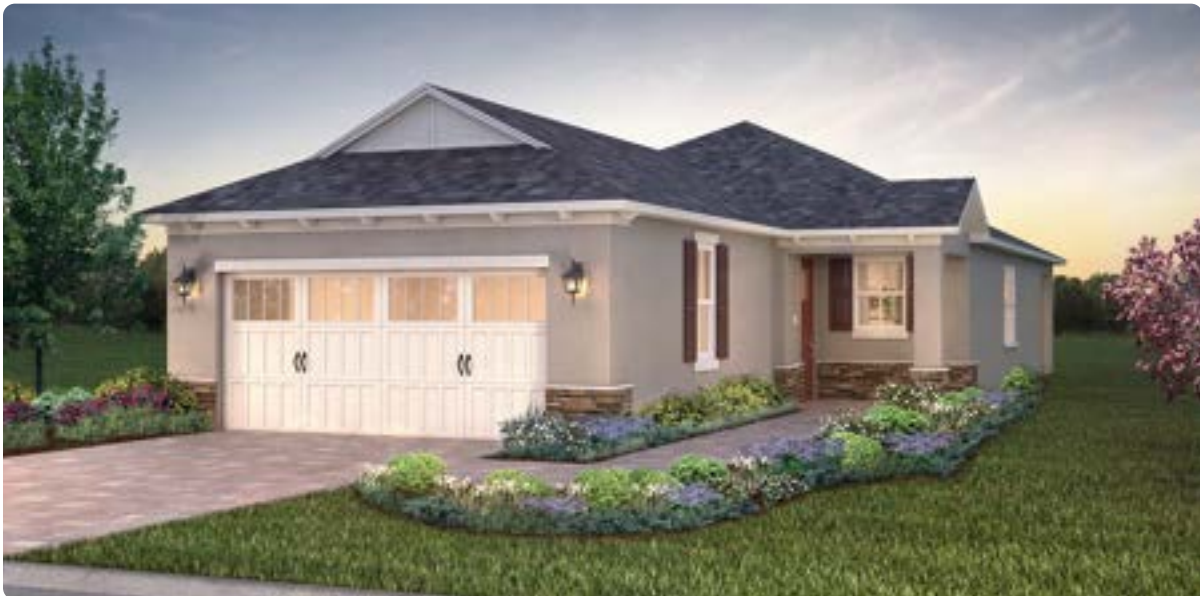
UPGRADED ELEVATION D