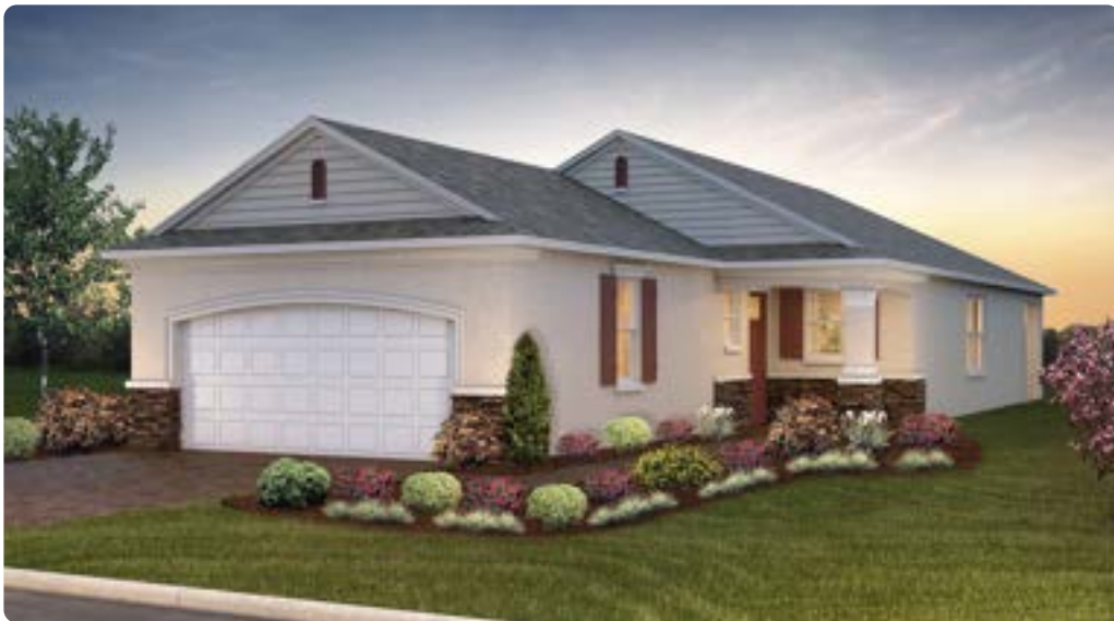
UPGRADED ELEVATION B