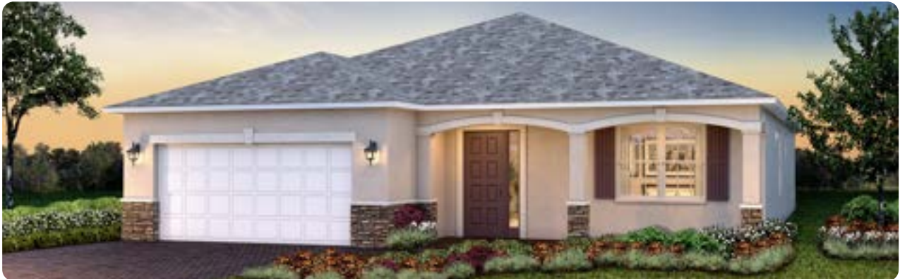
UPGRADED ELEVATION B