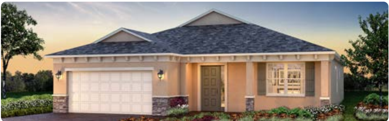
UPGRADED ELEVATION C