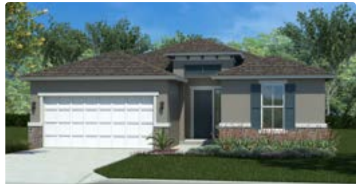
UPGRADED ELEVATION B