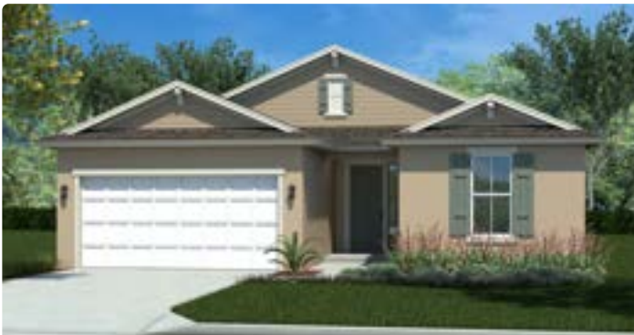
UPGRADED ELEVATION A