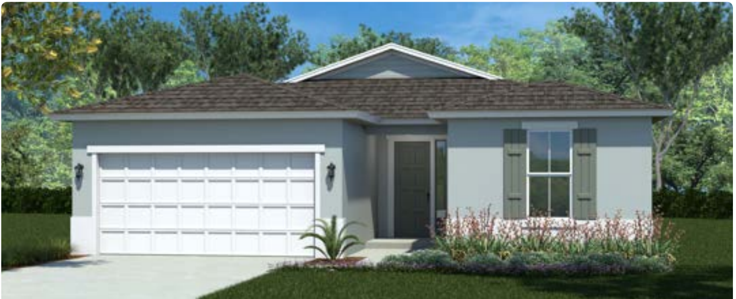
STANDARD XPRESS ELEVATION

3 Bedroom | 2 Bath | 2 Car Garage | Great Room | Breakfast Area | Laundry Suite | Patio 1,608 A/C Sq. Ft. | 2,083 Total Sq. Ft.