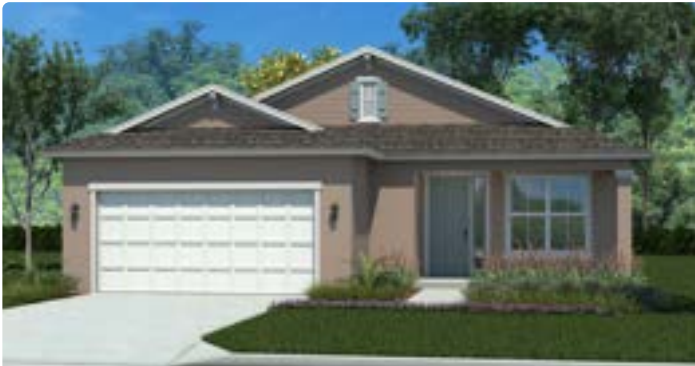
UPGRADED ELEVATION A