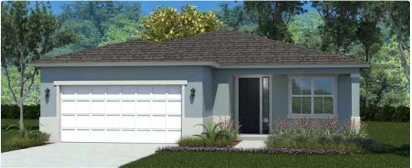
STANDARD XPRESS ELEVATION

3 Bedroom | 2 Bath | 2 Car Garage | Great Room | Flex Room | Laundry Suite | Covered Lanai 1,879 A/C Sq. Ft. | 2,585 Total Sq. Ft.