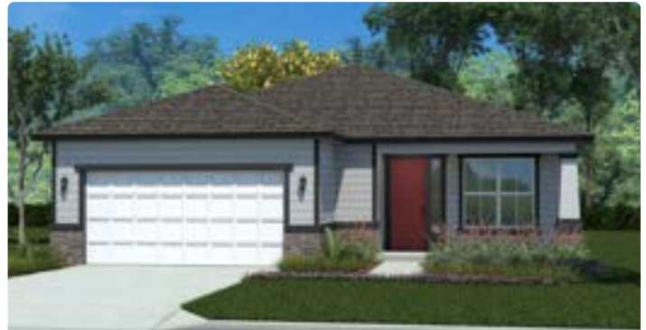
UPGRADED ELEVATION B