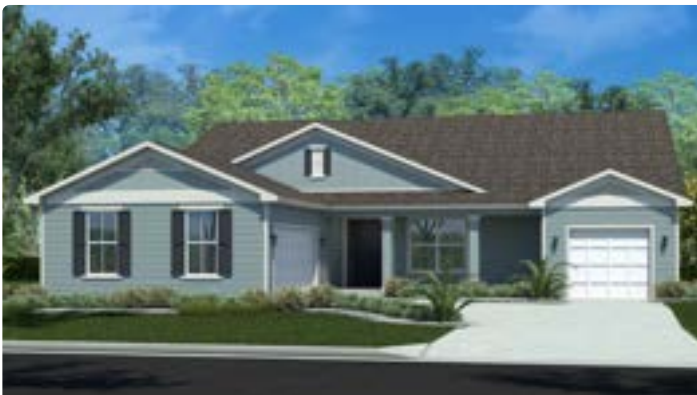
UPGRADED ELEVATION A