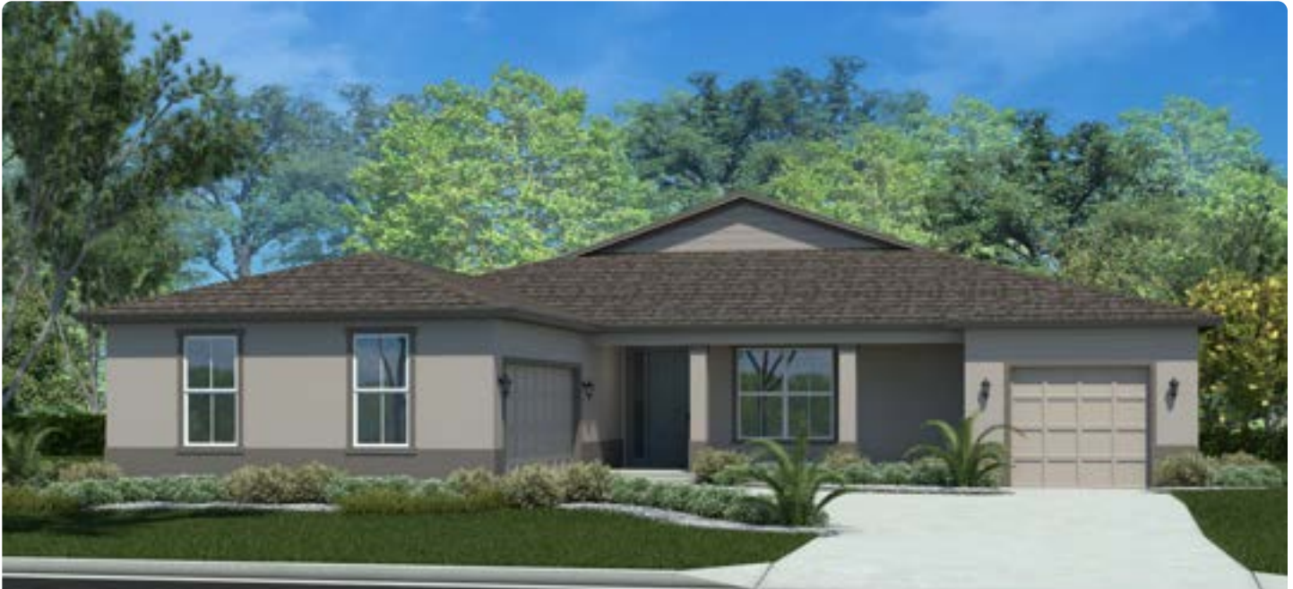
STANDARD XPRESS ELEVATION

4 Bedroom | 3 Bath | 3 Car Split Garage | Great Room | Flex Room Breakfast Area | Nest | Laundry Suite 2,876 A/C Sq Ft. | 4,229 Total Sq. Ft.