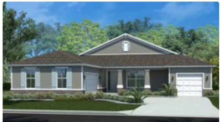
UPGRADED ELEVATION B