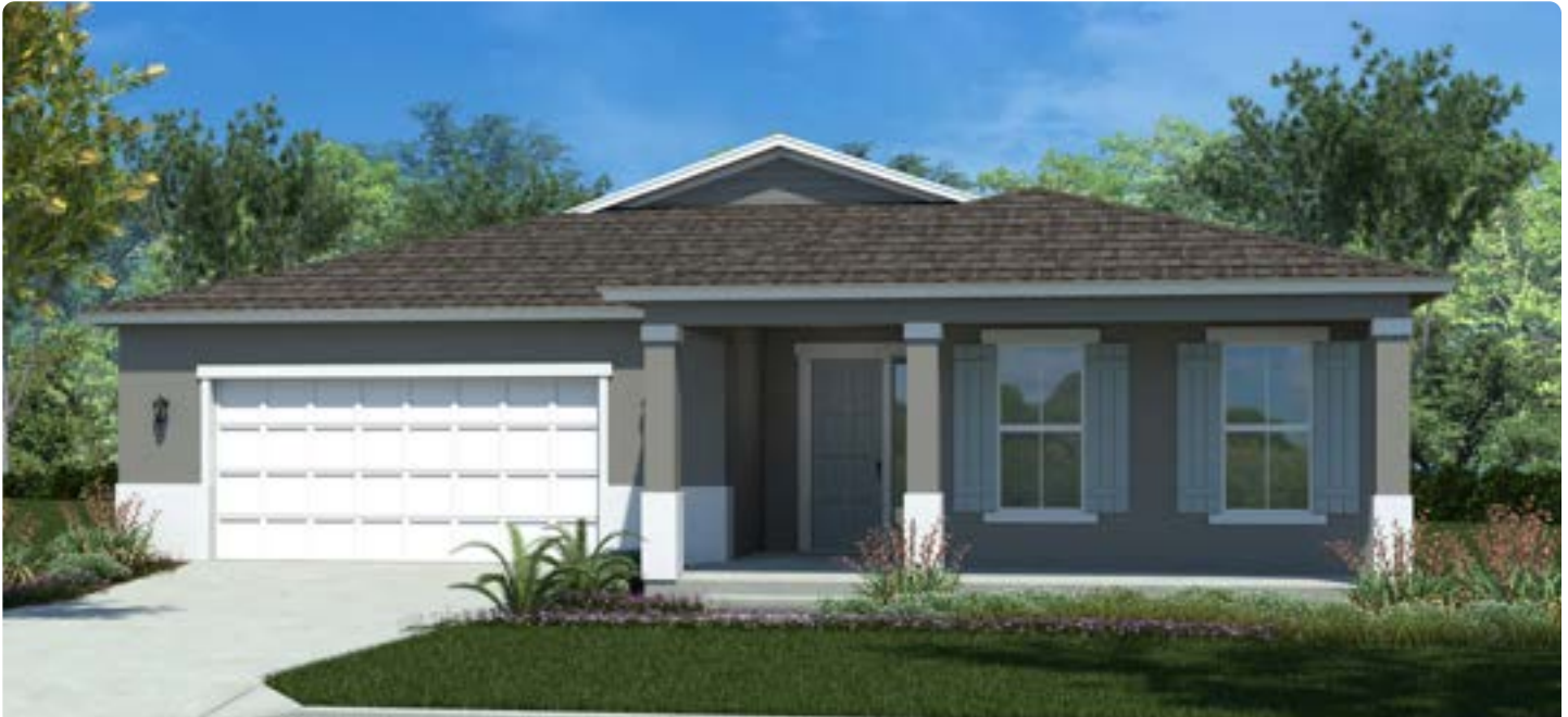
STANDARD XPRESS ELEVATION

4 Bedroom | 3 Bath | 3 Car Tandem Garage | Great Room Dining Room | Nest | Laundry Suite | Covered Lanai 2,671 A/C Sq. Ft. | 4,123 Total Sq. Ft.