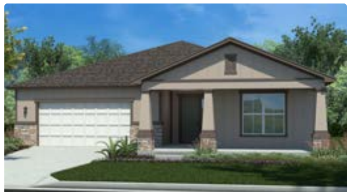
UPGRADED ELEVATION B