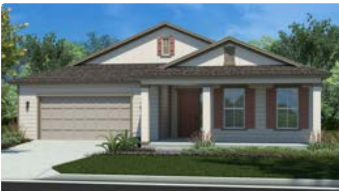
UPGRADED ELEVATION A