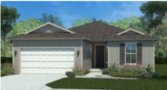
UPGRADED ELEVATION A