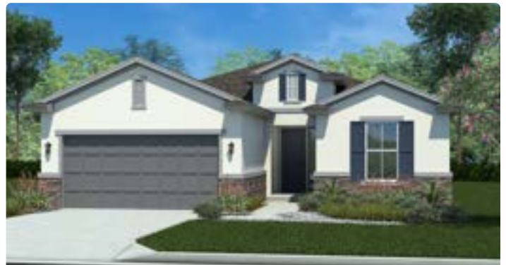
UPGRADED ELEVATION B