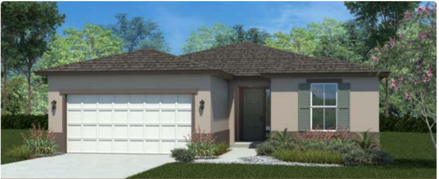
STANDARD XPRESS ELEVATION

4 Bedroom | 2 Bath | 2 Car Garage | Great Room | Breakfast Area | Laundry Suite | Patio 1,921 A/C Sq. Ft. | 2,428 Total Sq. Ft.