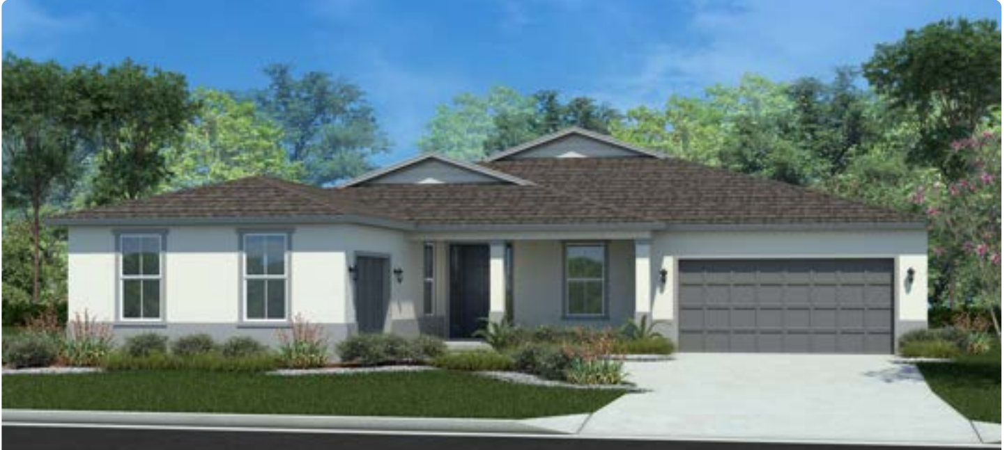
STANDARD XPRESS ELEVATION

5 Bedroom | 4 Bath | 3 Car Split Garage | Great Room | Dining Room Breakfast Area | Flex Room | Laundry Suite | Covered Lanai 3,197 A/C Sq Ft. | 4,502 Total Sq. Ft.