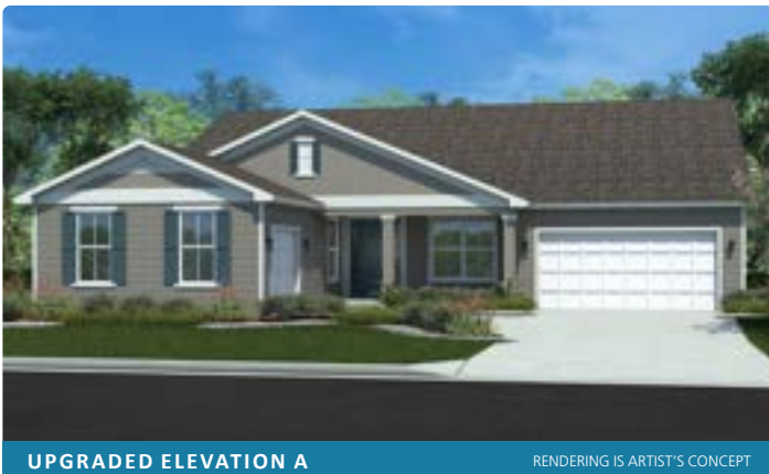
UPGRADED ELEVATION A