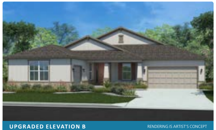
UPGRADED ELEVATION B