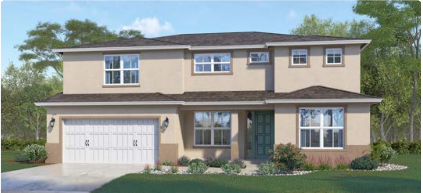
STANDARD XPRESS ELEVATION

4 Bedroom | 4.5 Bath | 3 Car Tandem Garage | Loft | Flex Room Dining Room | Great Room | Laundry Suite | Covered Entry | Covered Lanai 3,125 A/C Sq. Ft. | 4,113 Total Sq. Ft.