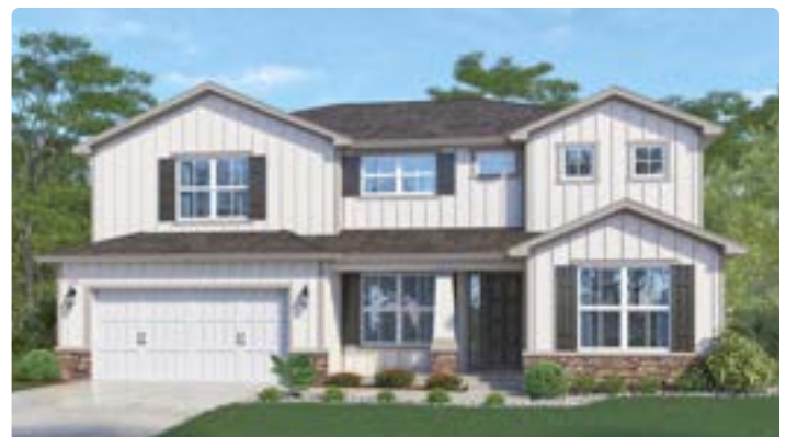
UPGRADED ELEVATION B