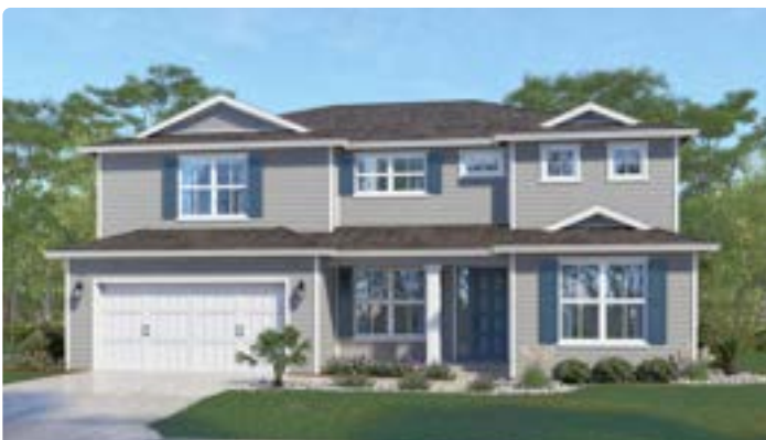
UPGRADED ELEVATION A