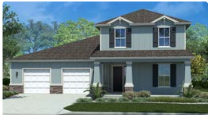
UPGRADED ELEVATION B