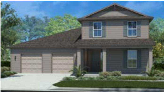
UPGRADED ELEVATION A