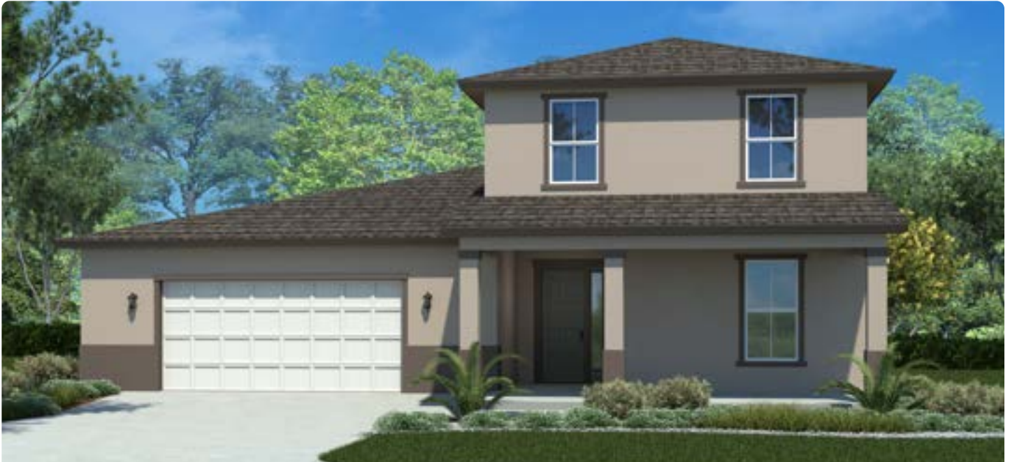
STANDARD XPRESS ELEVATION

5 Bedroom | 3.5 Bath | 3 Car Tandem Garage | Great Room Dining Room | Nest | Loft | Laundry Suite | Covered Lanai 3,374 A/C Sq. Ft. | 4,920 Total Sq. Ft.