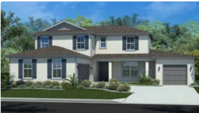
UPGRADED ELEVATION A