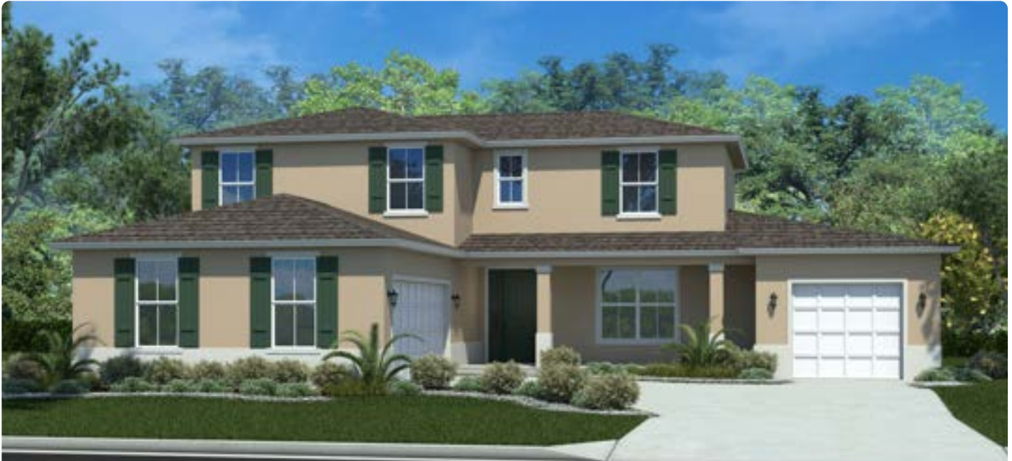
STANDARD XPRESS ELEVATION

4 Bedroom | 4.5 Bath | 3 Car Split Garage | Great Room | Dining Room Breakfast Area | Flex Room | Loft | Laundry Suite 3,802 A/C Sq Ft. | 5,146 Total Sq. Ft.