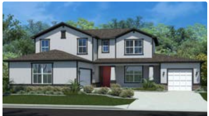
UPGRADED ELEVATION B