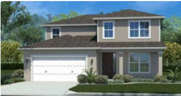
UPGRADED ELEVATION A