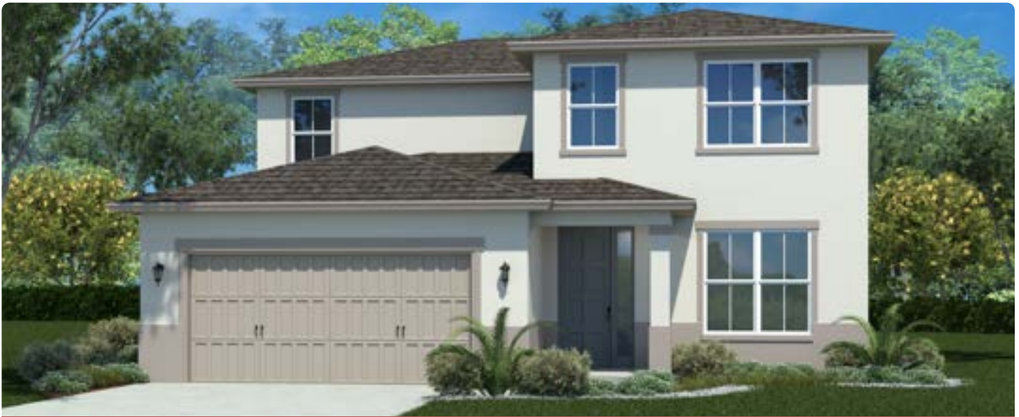
STANDARD XPRESS ELEVATION

4 Bedroom | 3 Bath | 2 Car Garage | Great Room | Dining Room | Flex Room | Laundry Suite | Patio 2,336 A/C Sq. Ft. | 2,811 Total Sq. Ft.