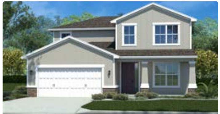
UPGRADED ELEVATION B